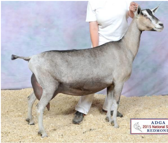
3 yrs old