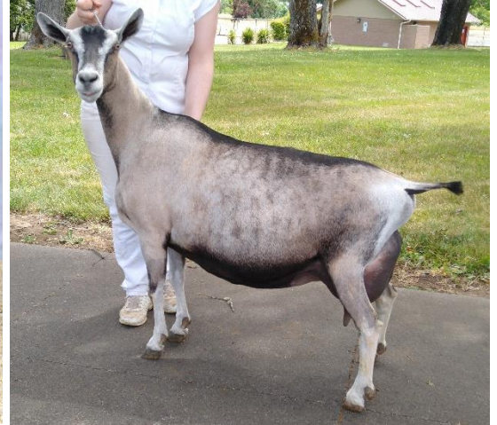
9 yrs old

3-2 FS92 EEEE, 4-2 FS92 EEEE, 5-2 FS92 EEEE, 6-3 FS92 EEEE, 9-2 FS93 EEEE, 11-3 FS93 EEEE