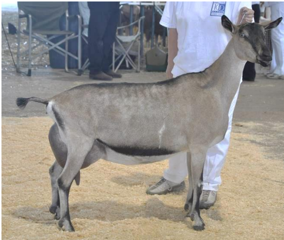
Living Free, 3 yrs