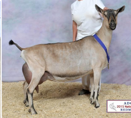
Living Free, 6 yrs