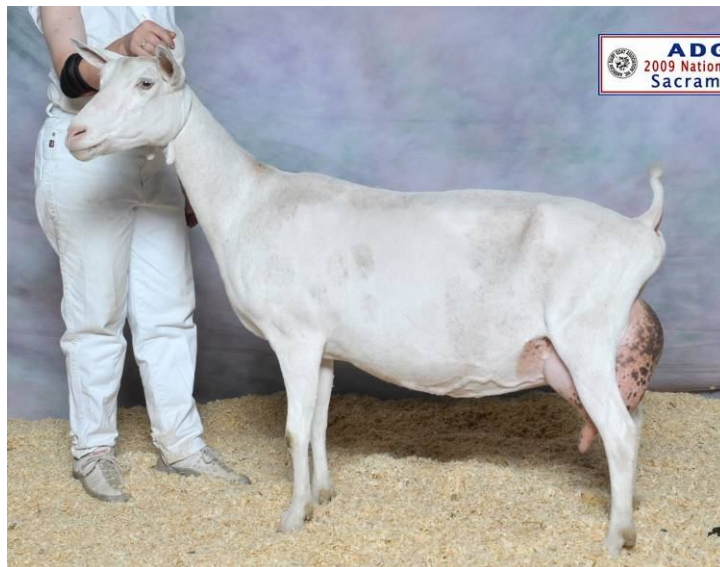
SGCH DES RUHIGESTELLE ELENDILI 8*M

3-3 FS92 EEEE, 4-4 FS92 EEEE, 5-3 FS92 EEEE