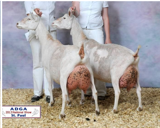
2013 ADGA National Show 1 st Place Dam & Daughter Dam- Elende (R) Daughter-Elenya (L)