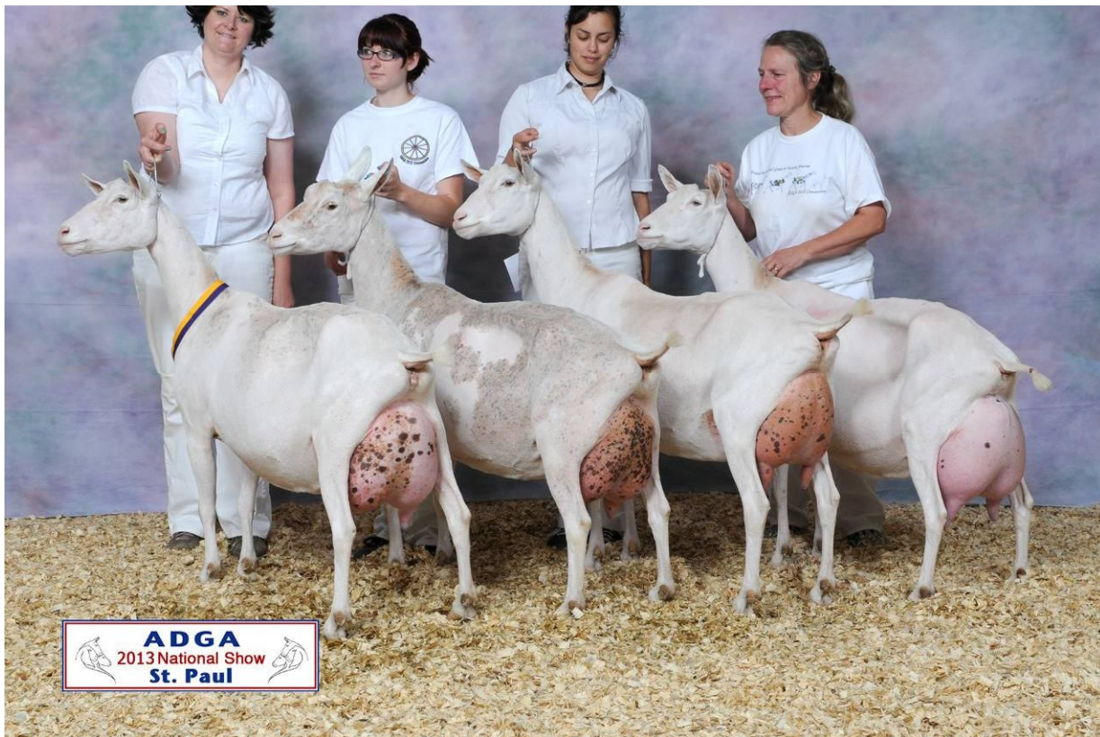
2013 ADGA National Show 1 st Place Dairy Herd (L-R) WinCatcher- 1 st 4 yr old, Grand Champion & Best Udder (WinSeeker daughter) Elende- 1 st /1 st udder 7 yr old, Total Performer Award (dam of Elenya) WinRiver- 1 st /1 st udder 2 yr old (WinSeeker daughter) Elenwe- 1 st /1 st udder 5-6 yr old (Elende daughter)