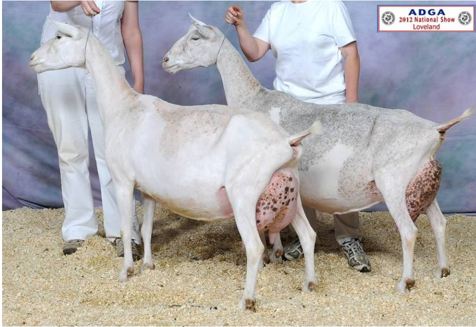
2012 ADGA National Show 1 st Place Dam & Daughter Dam- WinSeeker (R) Daughter-WinCatcher (L)