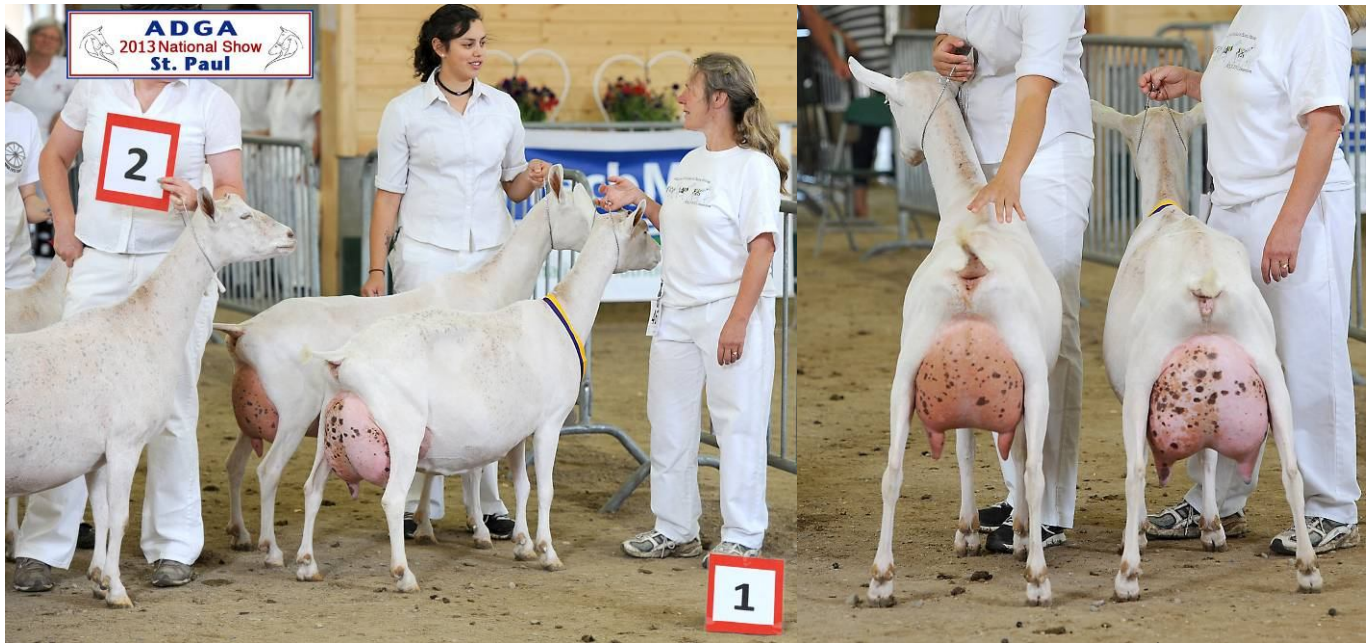
2013 ADGA National Show 1 st Place Produce of Dam (with Elende's Produce just behind in 2 nd ) Dam- WinSeeker Daughters-WinRiver (Back, L) WinCatcher (Front, R)