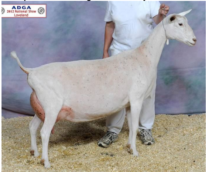
GCH DES RUHIGESTELLE ELENDARA 8*M