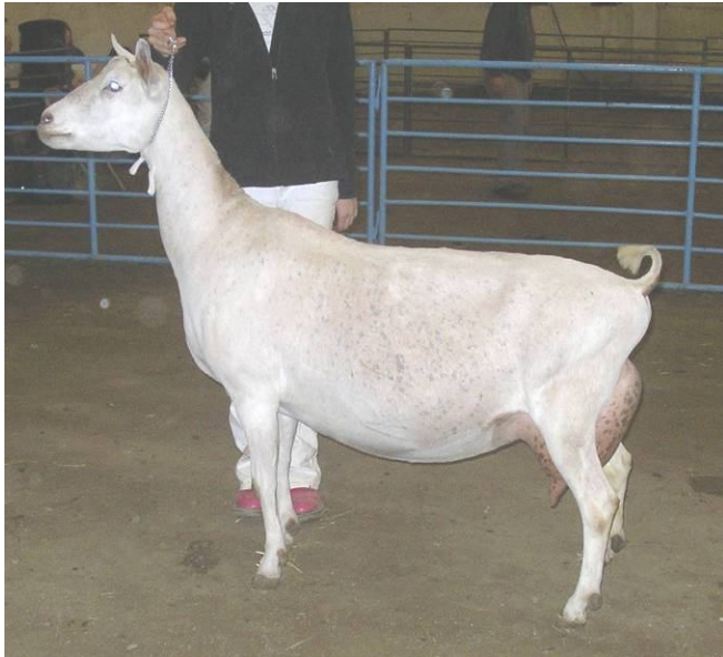
SGCH DES RUHIGESTELLE ELENYA 10*M Elite doe

LA 1-5 FS89 VVVE 2-4 FS92 EEEE 3-5 FS91 EEEE 4-4 FS92 EEEE 5-4 FS93 EEEE