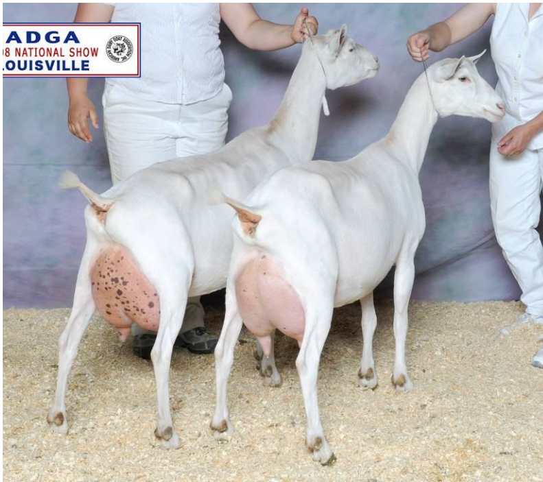
2008 ADGA National Show 1 st Place Produce of Dam 2009 ADGA National Show 1 st Place Produce of Dam Dam- Elendili Daughters-Elende (L) Elendrea (R)