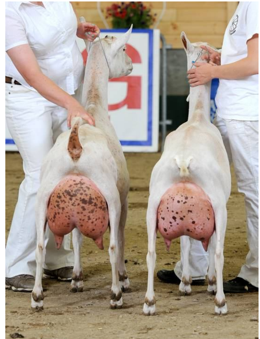
2013 ADGA National Show 2 nd Place Produce of Dam Dam- Elende Daughters-Elenya (L) Elixer (R)