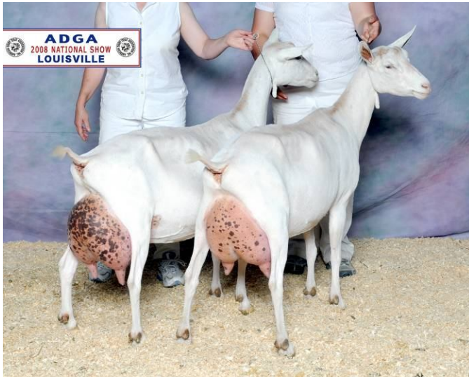
2008 ADGA National Show 1 st Place Dam & Daughter 2009 ADGA National Show 1 st Place Dam & Daughter Dam- Elendili (L) Daughter-Elende (R)