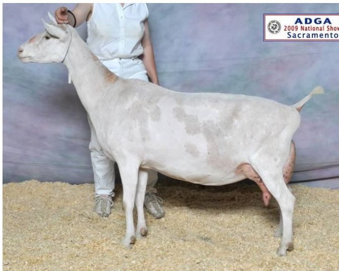
SGCH DES RUHIGESTELLE ELENDE 9*M

LA 7-4 FS92 EEEE, 8-4 FS92 EEEE 9xGCH or BOB, 3xBIS, 2xBUIS