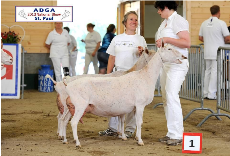
2013 ADGA National Show 1 st Place Dam & Daughter Dam- Elende Daughter-Elenya

If the genetics don't reproduce, they aren't reliable. It's not about one National Champion, or one famous sire, but about does with sisters and daughters that can keep doing it, generation after generation. Consistent, strong, powerful performance is what keeps the progress going. It is what keeps us moving forward. And it is what you can count on from a kid from here.